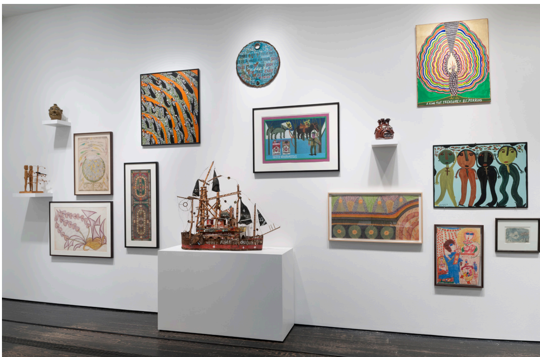
A salon-style presentation of works by various artists in the Menil Collection’s exhibition