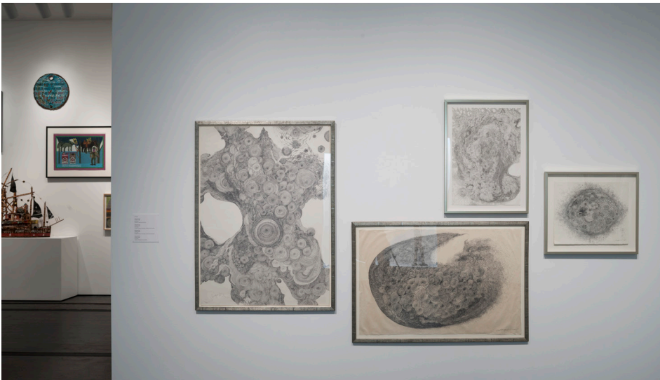
A group of drawings on paper by the Japanese artist Hiroyuki Doi on display in the current exhibition

Elsewhere, As Essential as Dreams features four fine drawings by the Mexican-born, outsider art master Martín Ramírez (1895–1963), including the stunning “Untitled (Tunnel with Cars and Buses)” (1954). This picture, in pencil and crayon on pieced-together bits of paper, shows a stream of automobiles, like a well-disciplined line of bugs, gliding into the mouth of a tunnel in a mountainside. Ramírez created this image with his signature sure, economical lines and a limited but expressive use of color, notably vivid blues and purples to highlight the tunnel entrance and some tall trees.