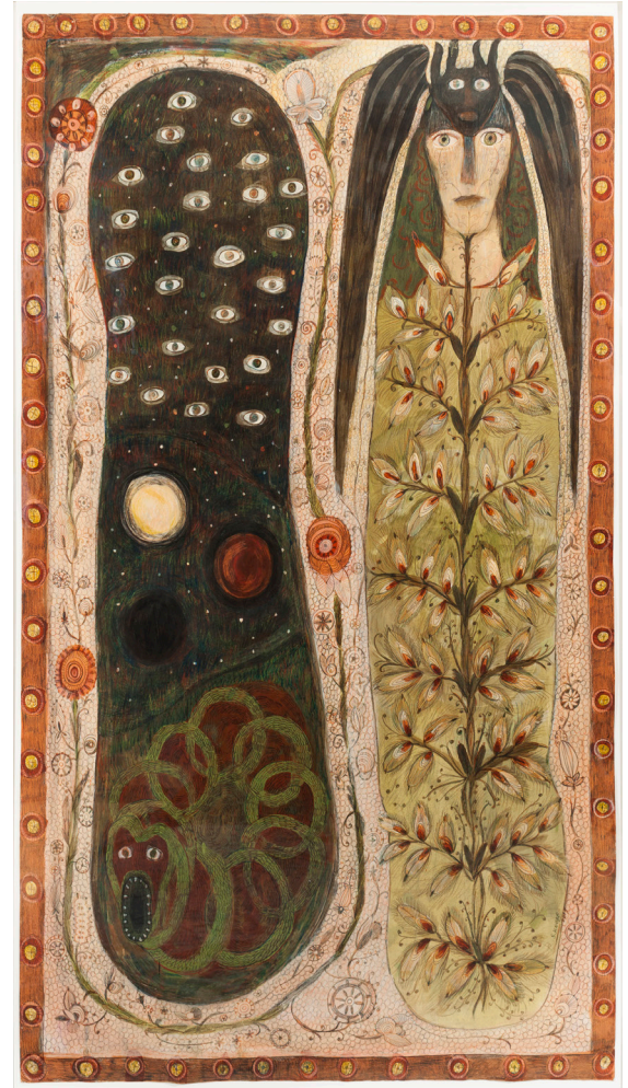
Solange Knopf, "Spirit Codex No. 14" (2013), acrylic, colored pencil and pencil on paper, 70 1/4 x 39 1/8 inches (The Menil Collection, promised gift of Stephanie and John Smither)

Research-travel support for this article from Visit Houston and The Whitehall Houston is gratefully acknowledged.