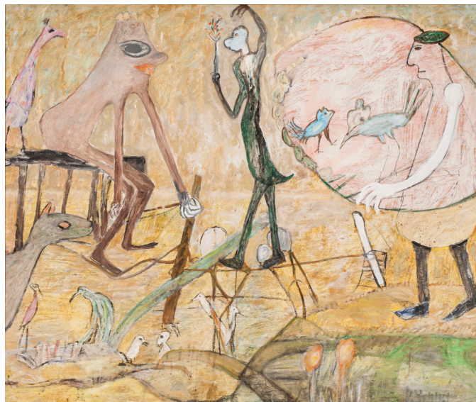
Jon Serl, "Back Yard Circus" (circa 1967-75), oil on wood, 48 1/4 x 57 1/2 inches (The Menil Collection, promised gift of Stephanie and John Smither, photo © Estate of Jon Serl, courtesy of Cavin-Morris Gallery)

Another painter, Jon Serl (1894–1993), who lived in a big house in the California desert, surrounded by chickens and dogs, had performed in vaudeville shows before turning to art-making in his forties. His oil paintings on found boards or canvases portray human, animal and phantom-like figures in dreamy, inexplicable scenes. Their mystery is compounded by their richly colored, atmospheric backgrounds and the complex but indecipherable dramas in which their subjects are engaged.