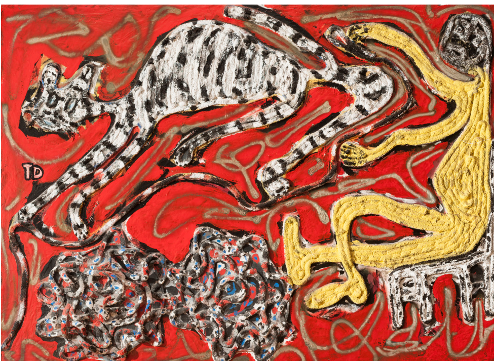
Thornton Dial, “Tiger on the Run” (1992), oil paint, spray paint, rope and rubber on canvas, 56 x 79 3/8 x 4 3/4 inches (The Menil Collection, promised gift of Stephanie and John Smither)

Also on view are works by Oscar Hadwiger (1891–1989), a carpenter, inventor and tool-and-die maker who, in his retirement, skillfully crafted ornate towers, churches and other structures using marquetry (inlaid wood) techniques, and a mixed-media painting, along with drawings in pencil, watercolor and charcoal on paper, by the Alabaman Thornton Dial (1928–2016). The painting, “Tiger on the Run” (1992), features an animal figure made with painted rope affixed to the surface of a canvas. Throughout his technically inventive, eloquent oeuvre, Dial used the tiger as a symbol of the black man as a survivor and a not-to-be-ignored, central player in the broader pageant of American and world history.